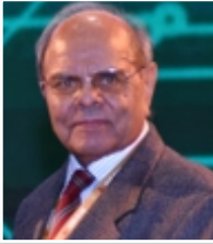
LT. GENERAL PREM SAGAR FORMER DG - IISSM