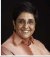
DR. KIRAN BEDI FORMER IPS OFFICER AND LT. GOVERNOR OF PUDUCHERRY